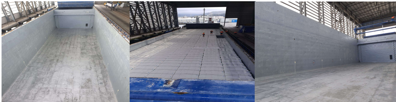
MV "VALENTINA" HOLD DIMENSIONS

Pandi THOMAS MILLER H&M RAY Sigorta A.S.